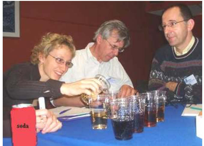
One of the groups at work making up the dilutions ...